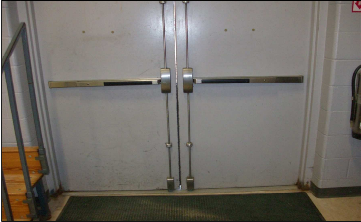
Doors at gym. Note lack of astragal between doors and corrosion at door frame.