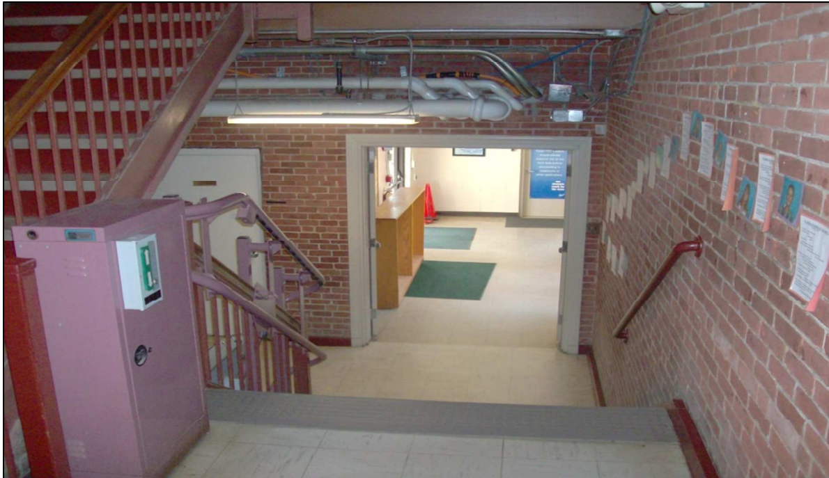
Stairway to library in basement of original section of school. Note chair lift from basement to first landing. It does not extend above that level.