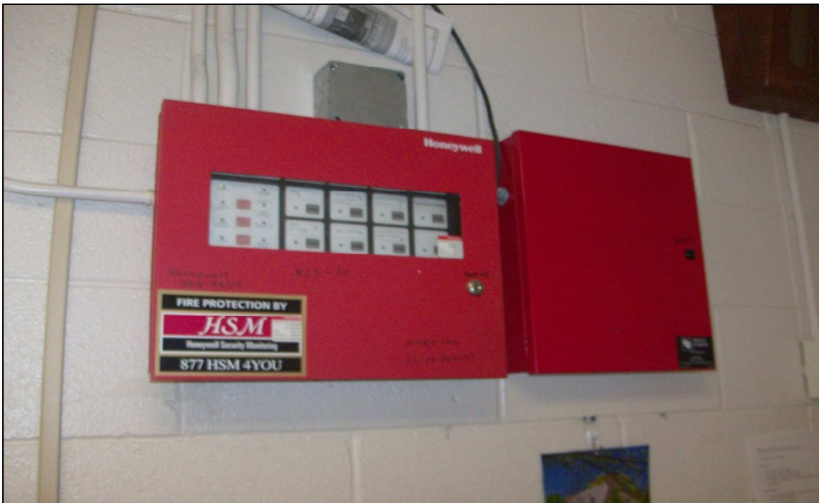
Fire alarm panel needs upgrade to new modern addressable panel.