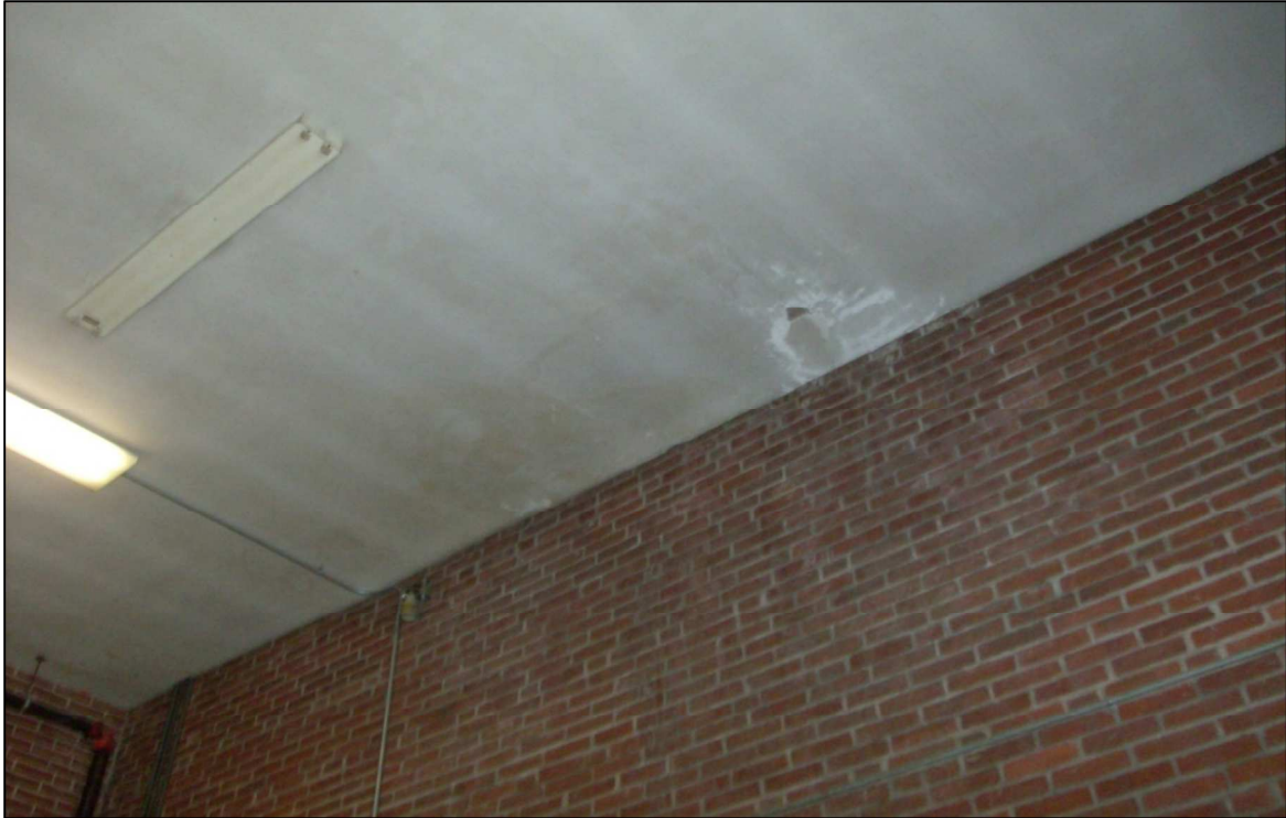
Staining on ceiling of stairwell between 1945/1950 and 1970's additions.