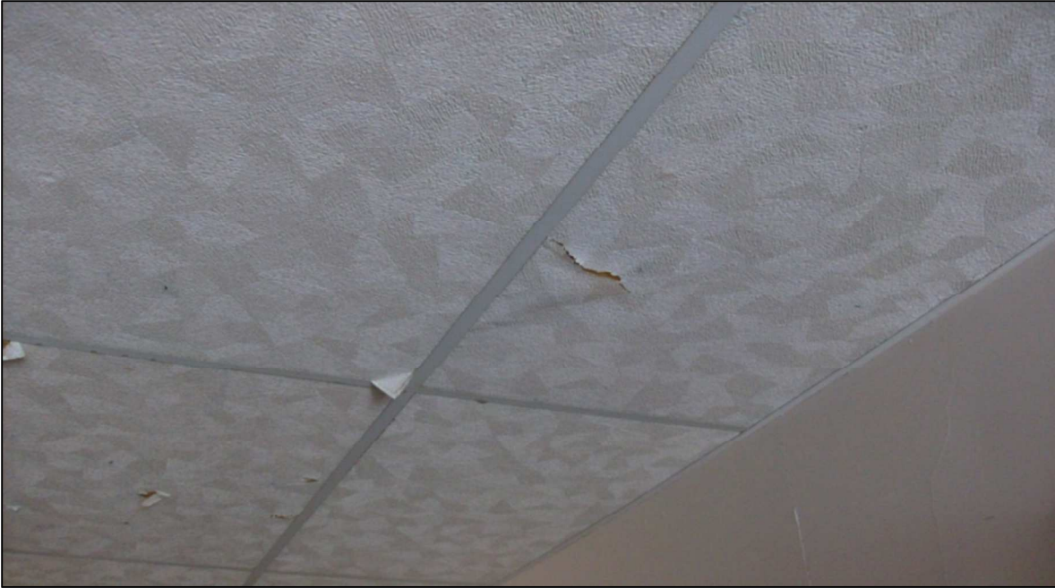
Damage to vinyl coated acoustical ceiling tile in the original section of the school.