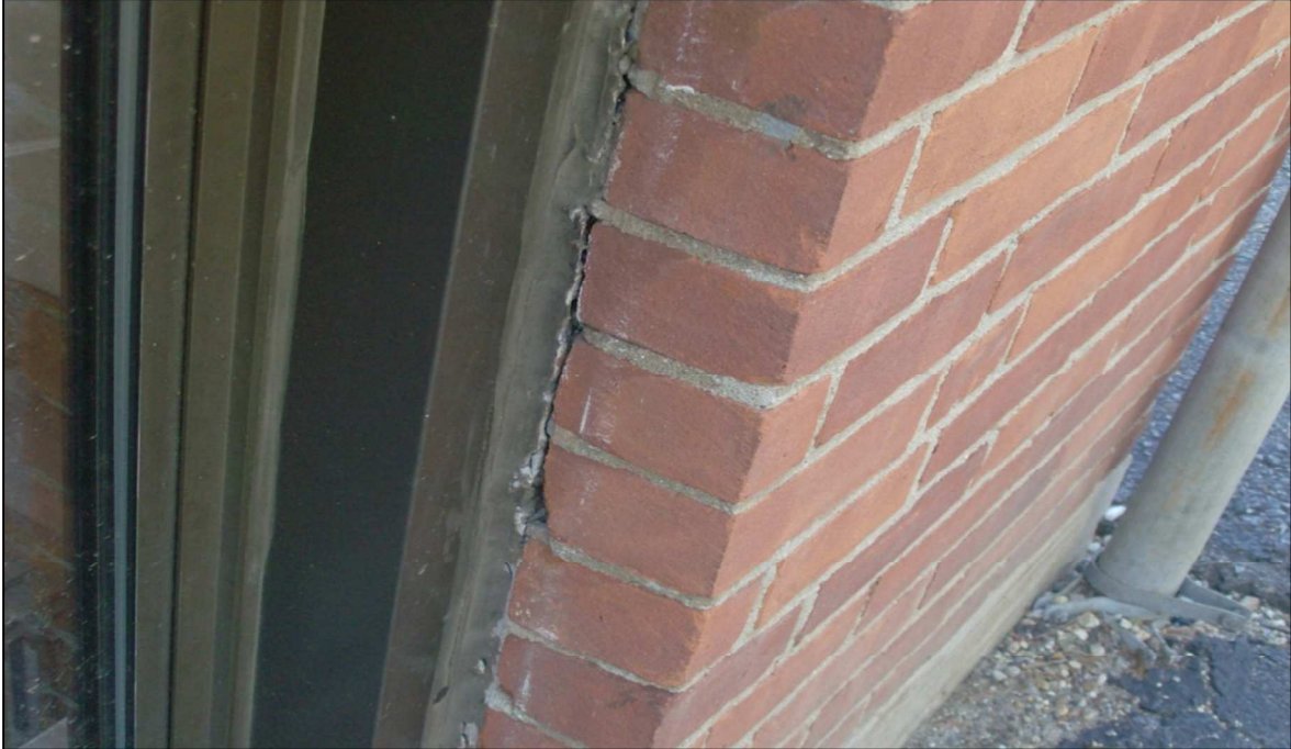
Missing sealant between window frame and brick at 1950's addition.