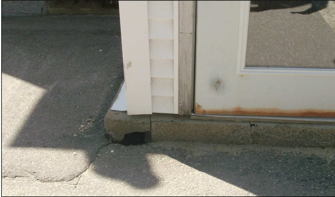
Exit from the basement level of the original school. Note rusted door and hole in foundation.