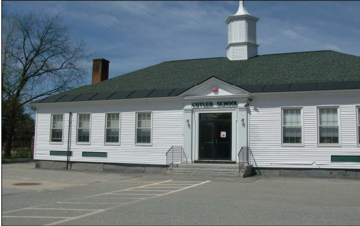
The original Cutler School with an east facing entrance.