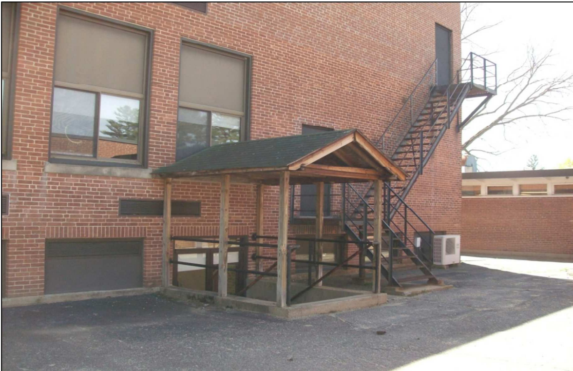
Wood framed canopy over basement exit. Also steel fire exit stairs from first and second floors.