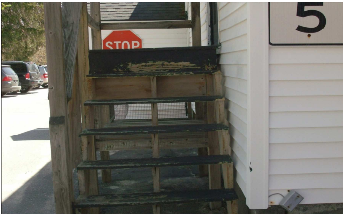
Non-compliant stair set providing exit from a classroom on the main floor of the original building.