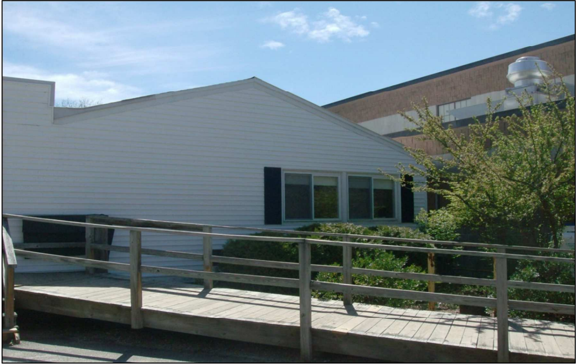
Accessible ramp to rear entrance at portable classroom units.