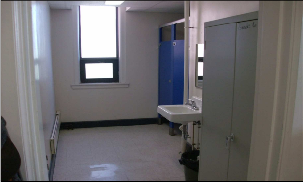
Typical bathroom in 1945/1950 addition. There is a lack of fully accessible stall.