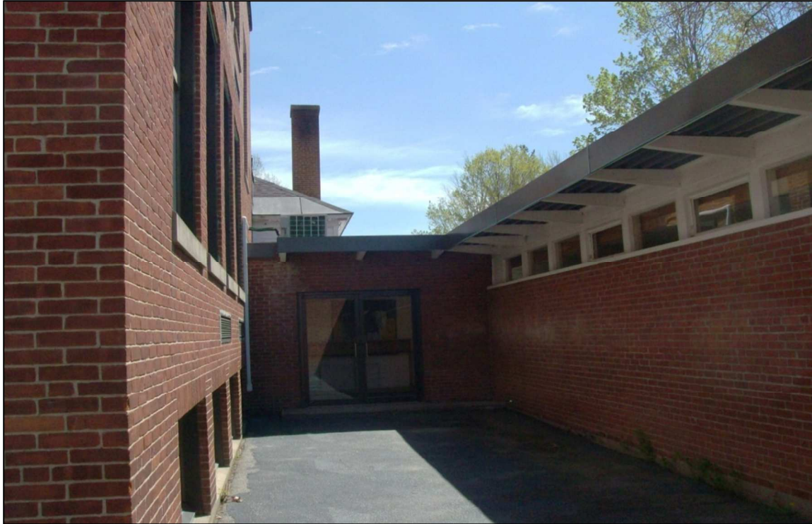
Paved courtyard between the 1945/1950 and 1970 additions. Note overhanging wood roof support beams.