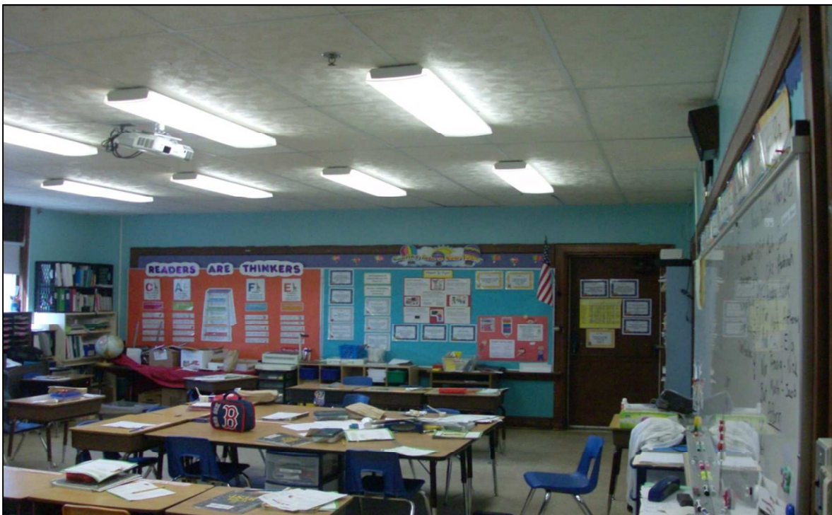
Typical classroom in original section of school.