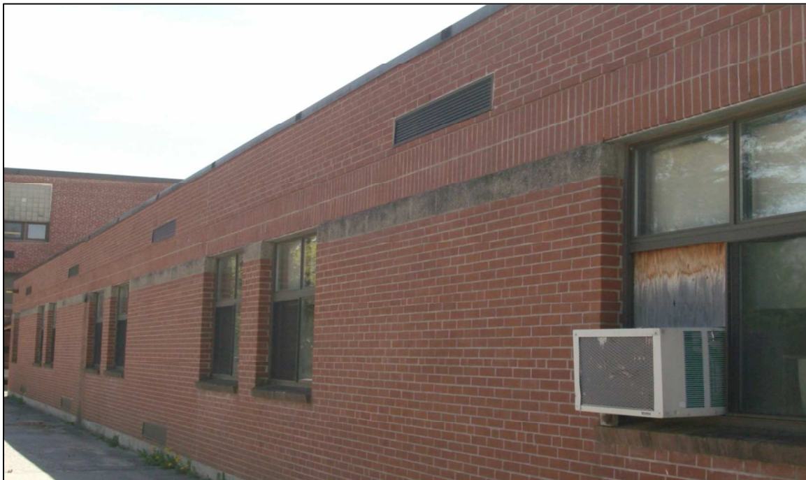
North façade of 1990's wing. Note staining on precast accent piece and individual AC unit.