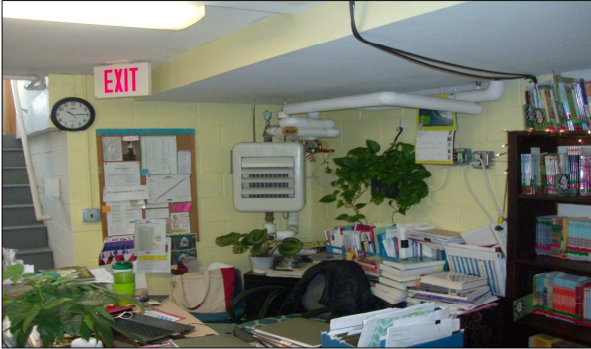
Office in literary room in basement of original school.