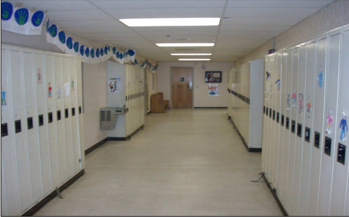
View of corridor in the 1990's wing.