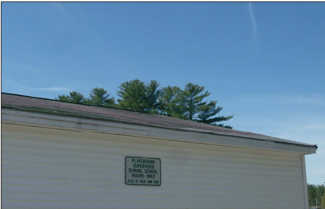
Shingle roof of portable units nearing end of life.