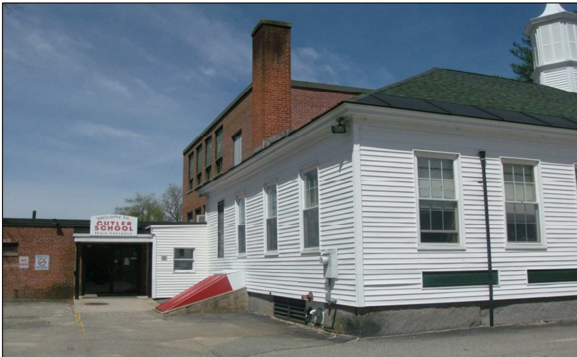
Looking west, just south of the original school is the main entrance, built as part of the 1970's addition.