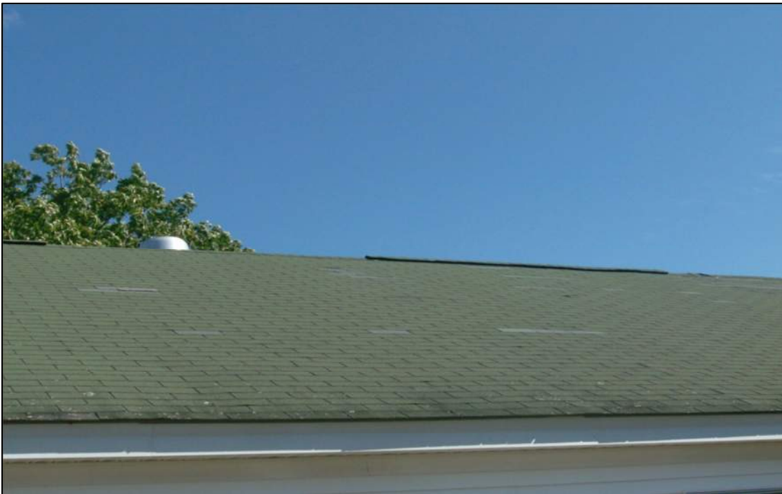
Most of the roofing needs to be replaced.