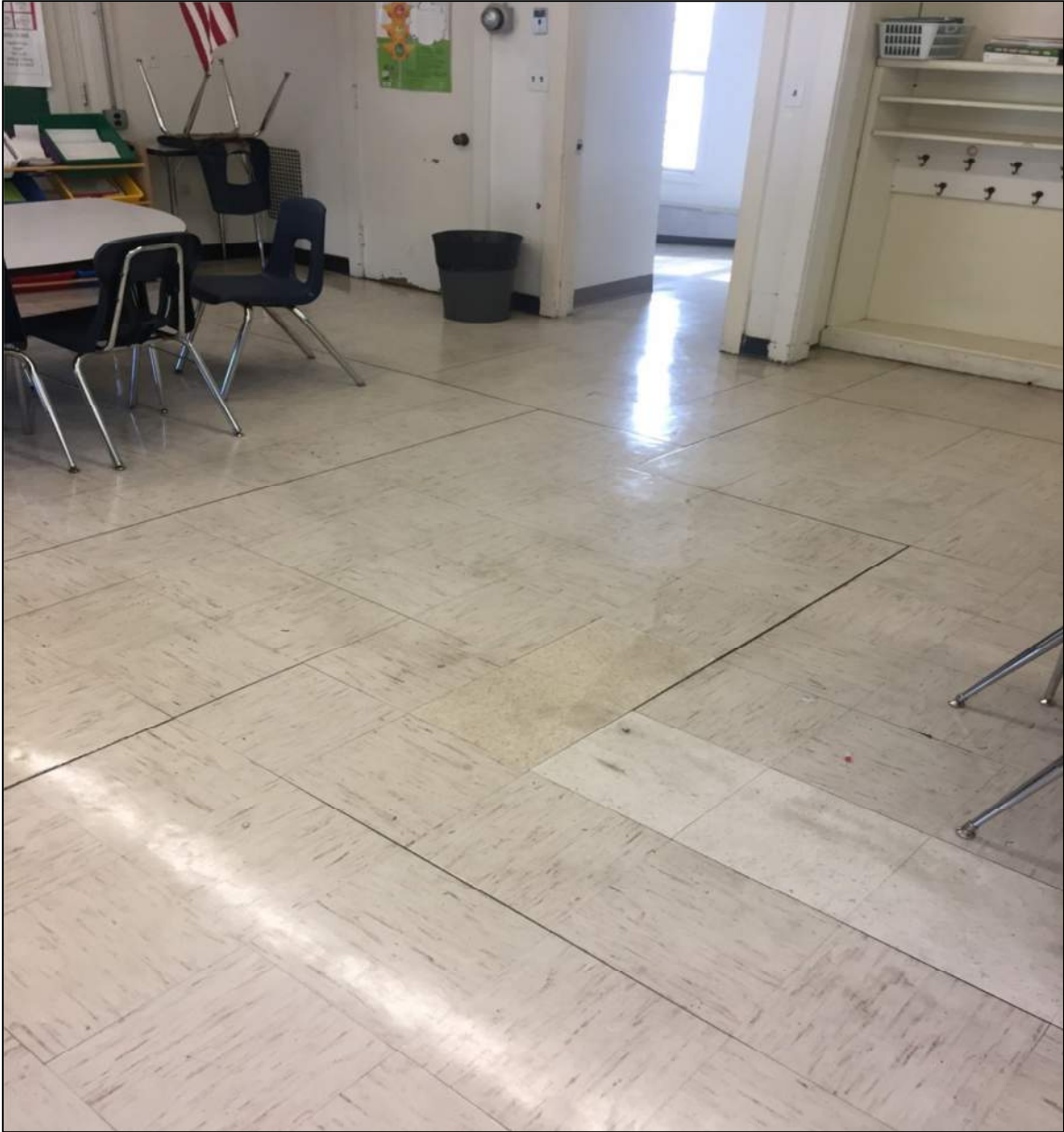
VCT flooring in 1950's addition. Note gaps in tile and past areas of tile replacement.