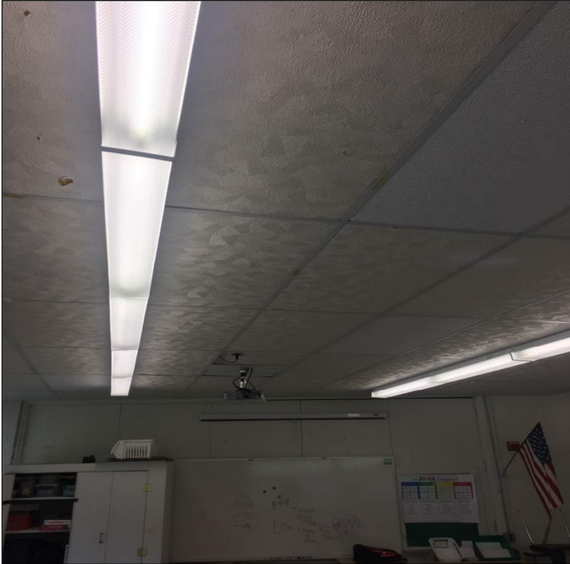
Drop ceilings need to be replaced and upgraded.