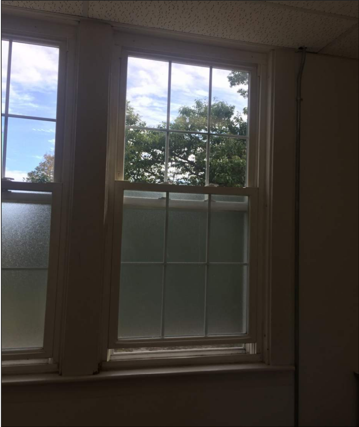
Old double-hung style windows in section of original school.