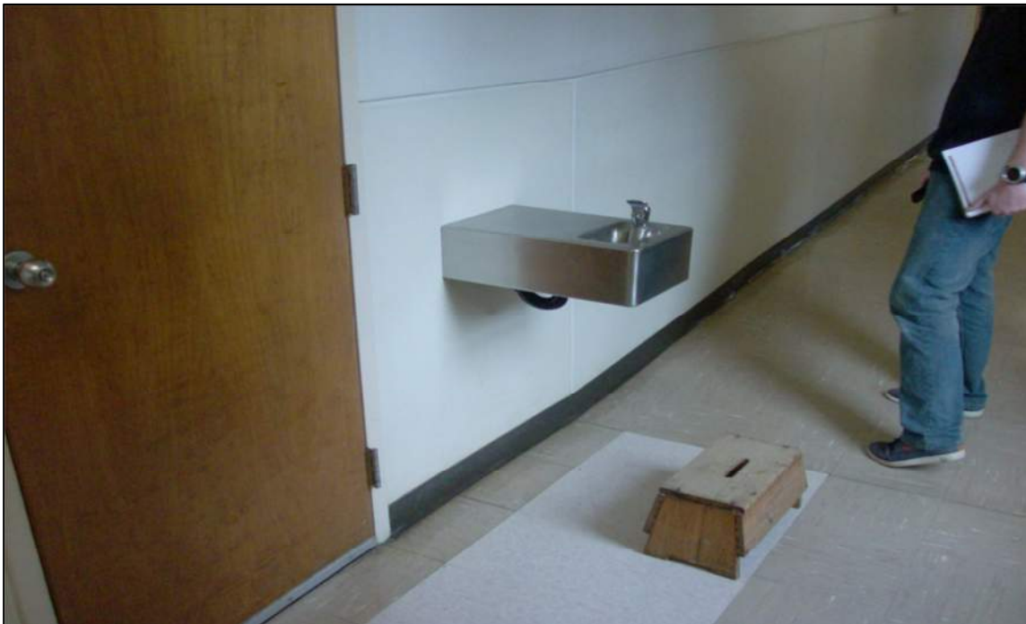
Drinking fountain extends out into corridor and creates an obstruction.