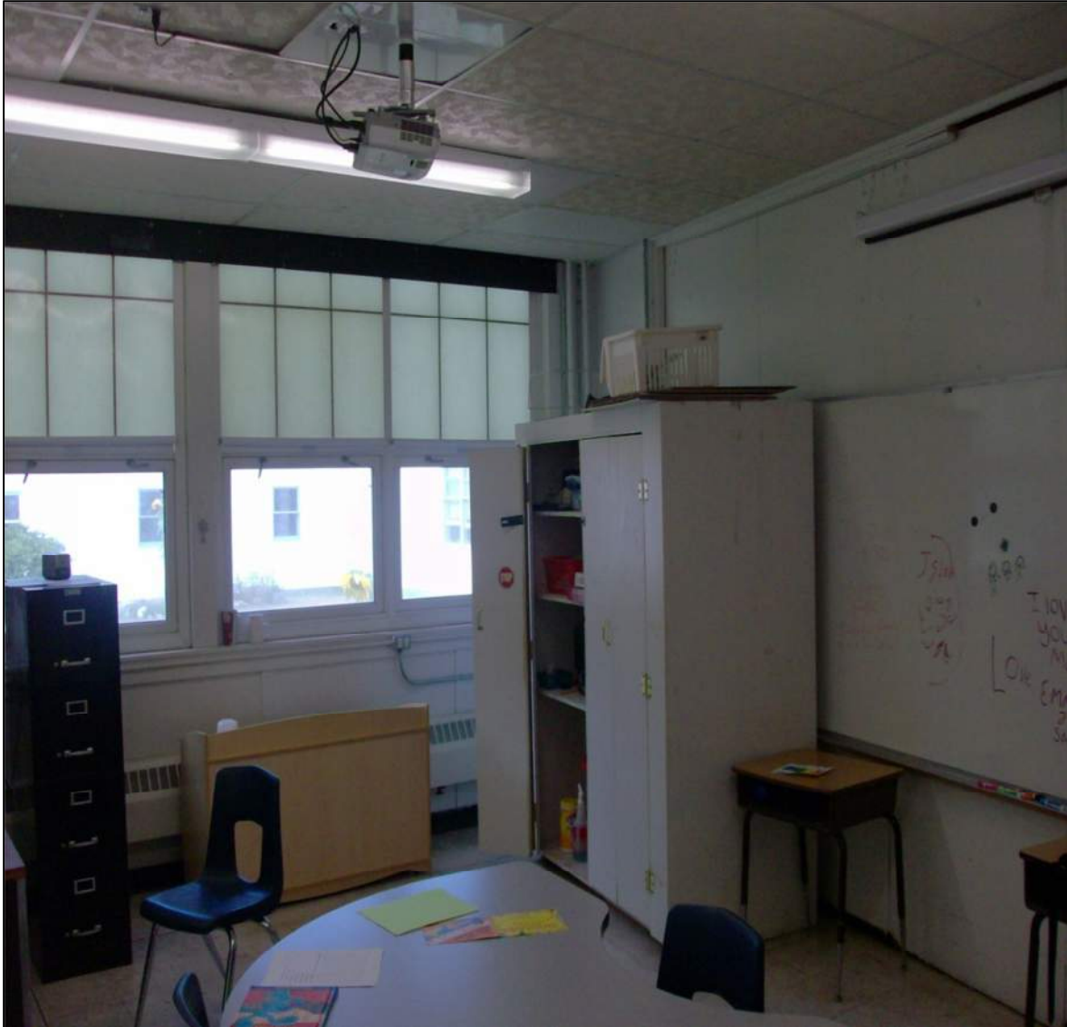
Old hopper-style windows with Kalwall panels above.