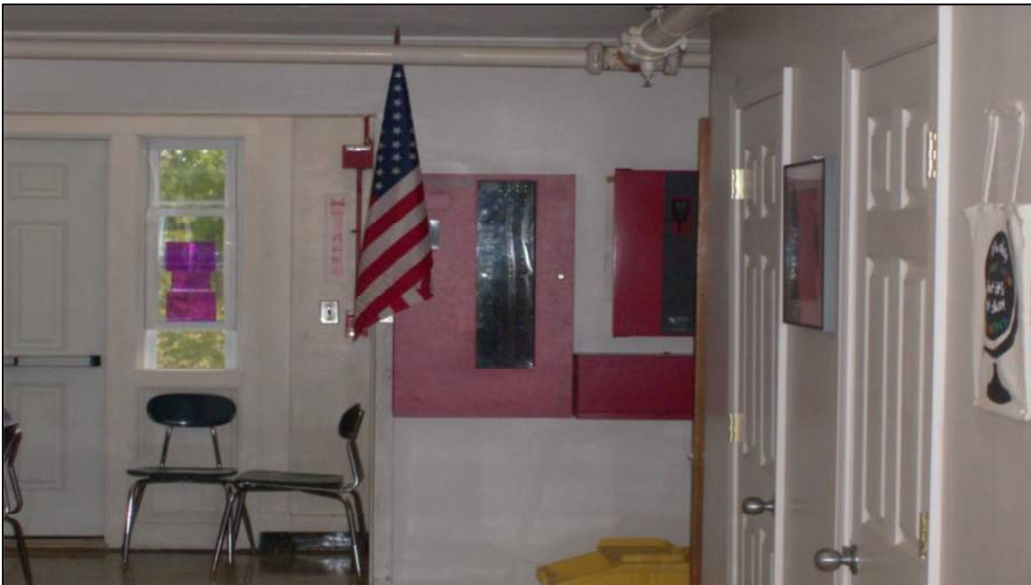
Fire alarm panel in original section of school.