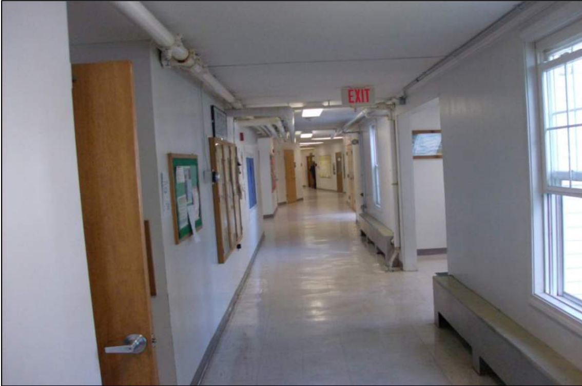
Note exposed sprinkler and heating pipes below ceiling.