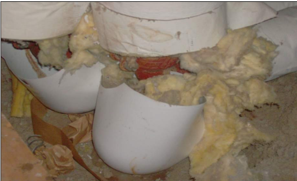
Original pipe insulation removed, but not properly replaced.