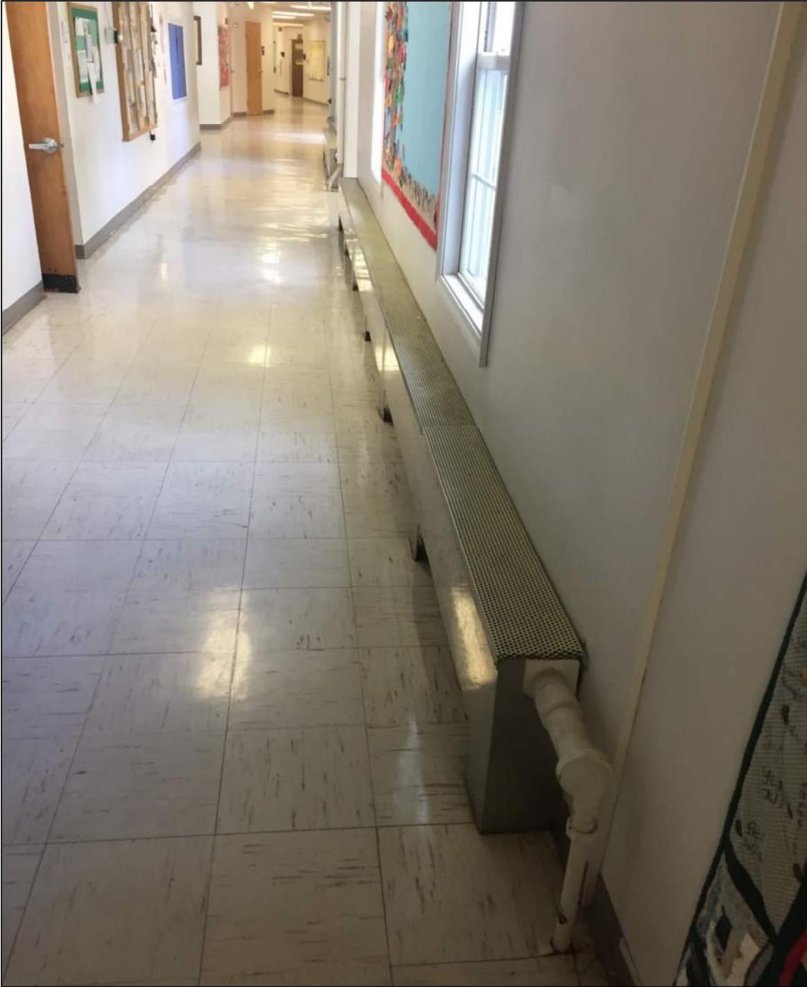
Fin tube radiators in corridor.