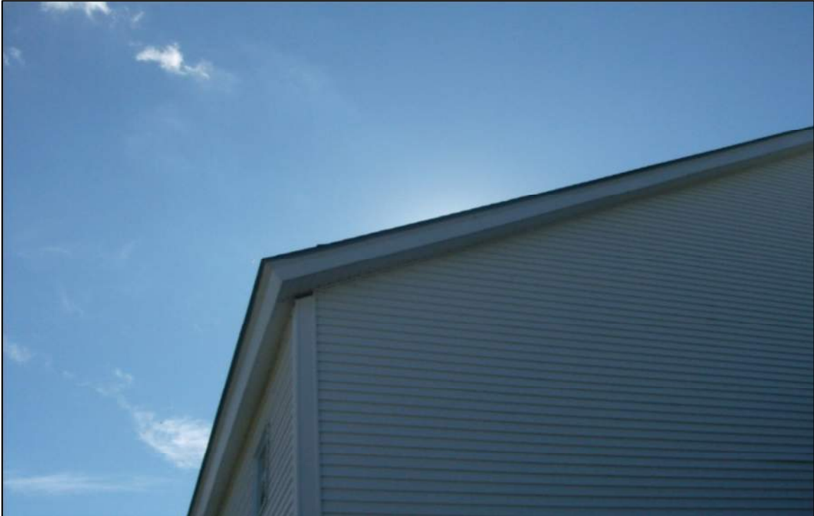
Gap in trim on north side allows water to penetrate.