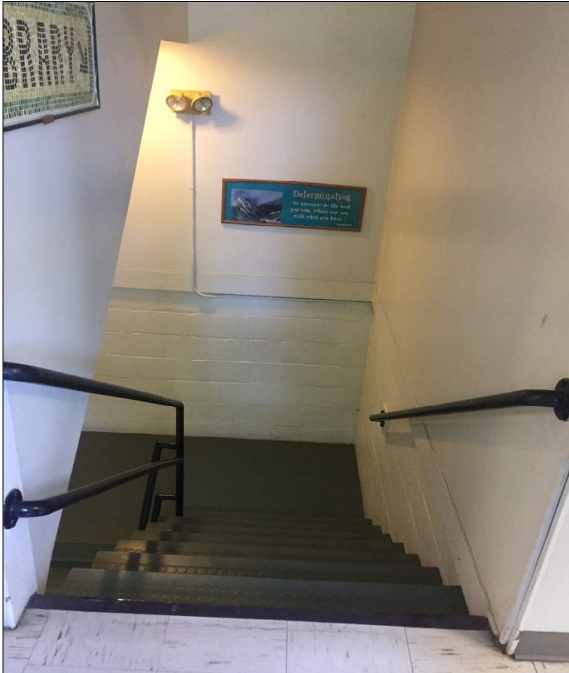
Stairway into basement with non-compliant handrail.