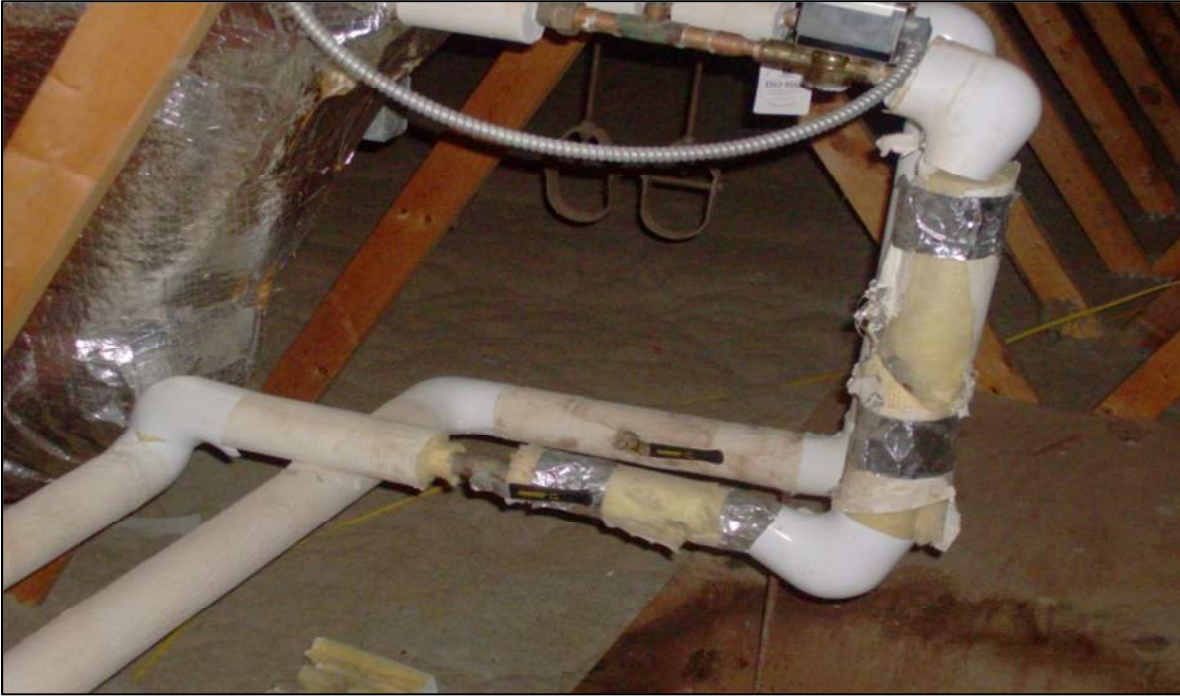
Section of heating piping in attic with no insulation.