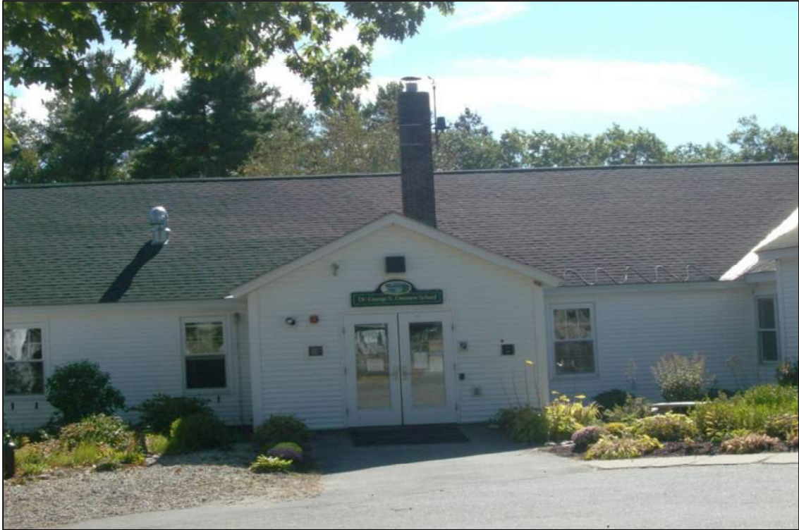
Main entry to Emerson Elementary School.