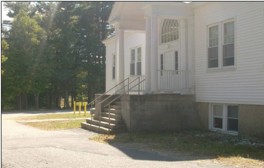
Former main entry on east side. Stairs are non-compliant.