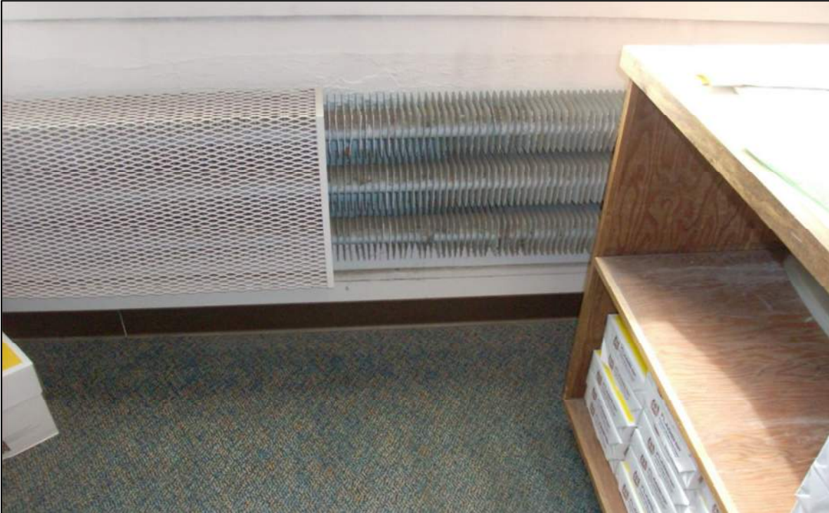
Typical fin tube radiators in older sections of school.