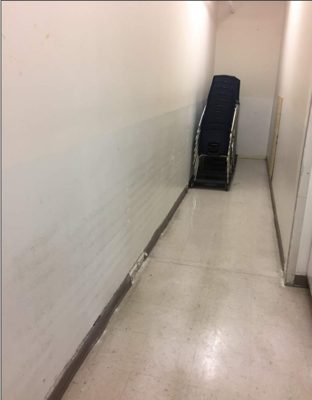
Area adjacent to Gym used for storage of chairs. Note damaged walls and baseboard.