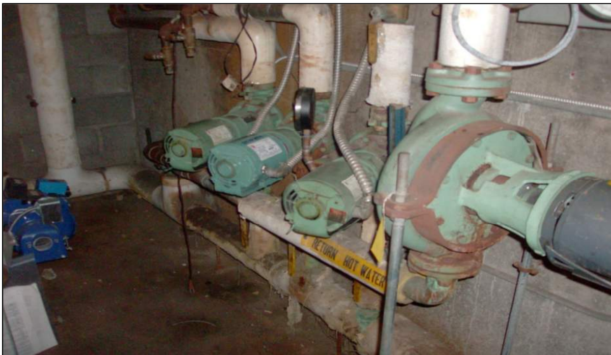
Two of three circulating pumps should be upgraded.