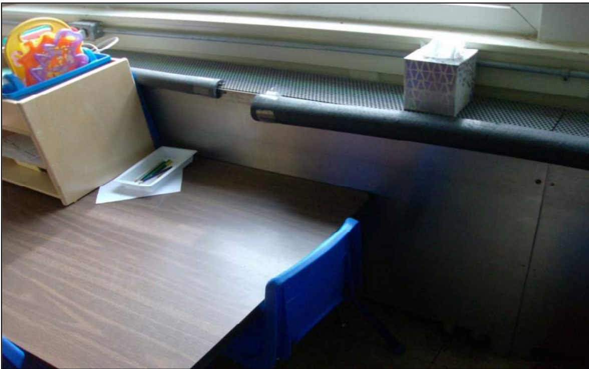
Fin tube radiators with vented covers.