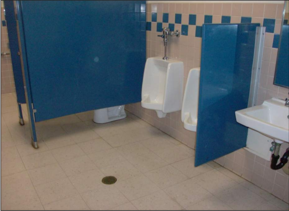
Typical gang bathroom.