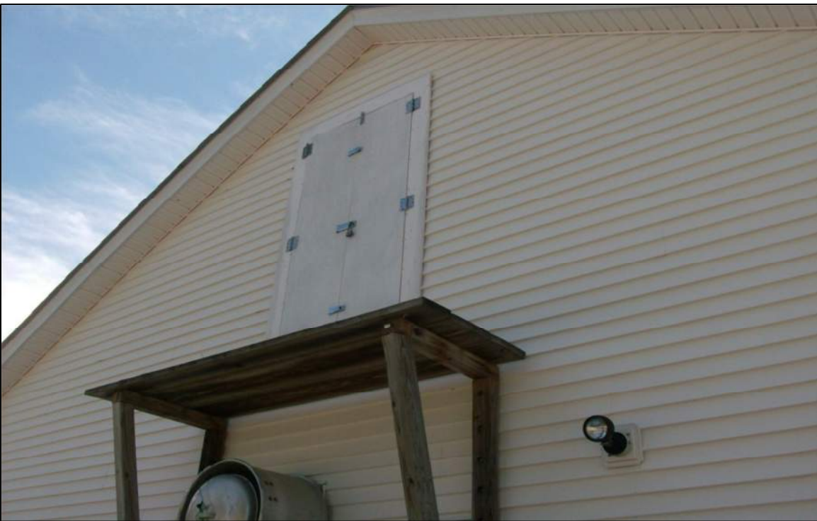
Platform to access HVAC unit over kitchen. No handrail makes this particularly dangerous.