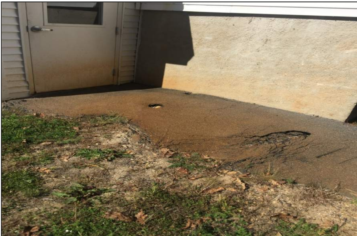
Door on east side is rusting and note poor condition of pavement.