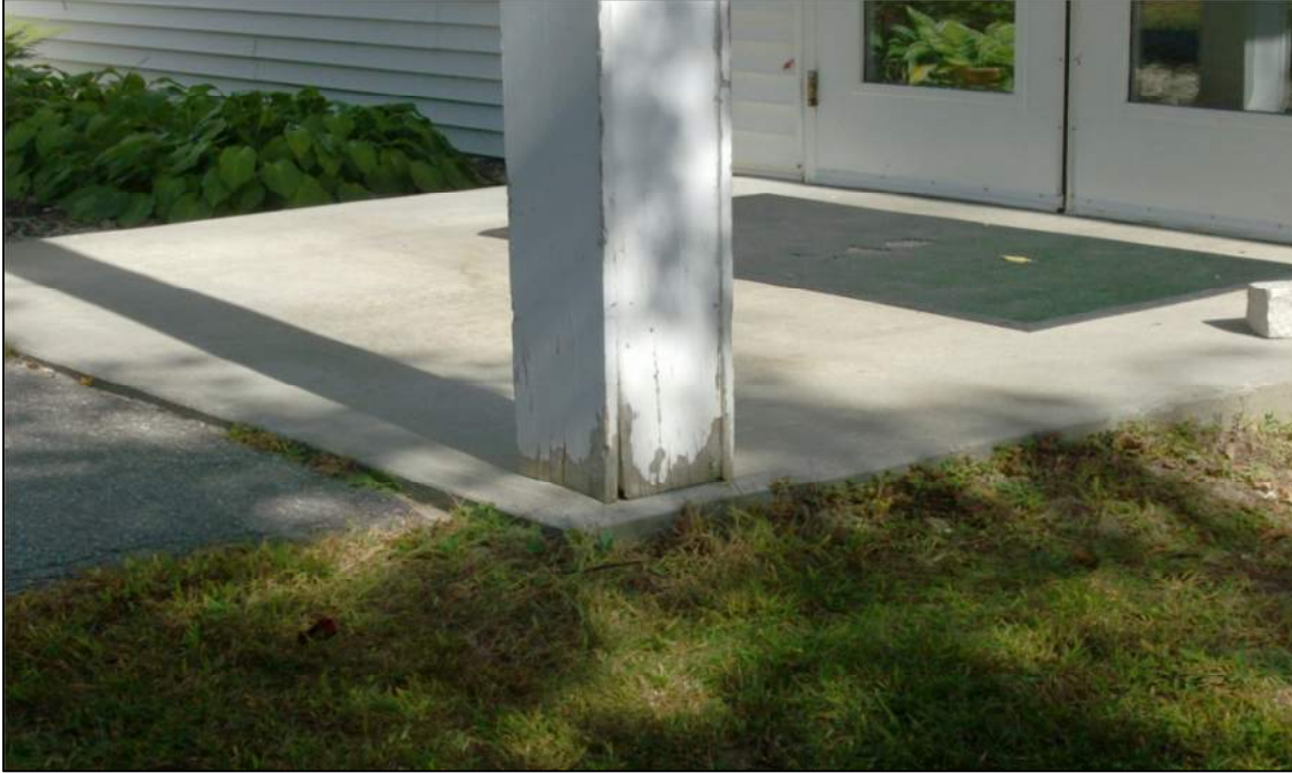
Posts at west entrance needed paint and showed signs of wood rot.