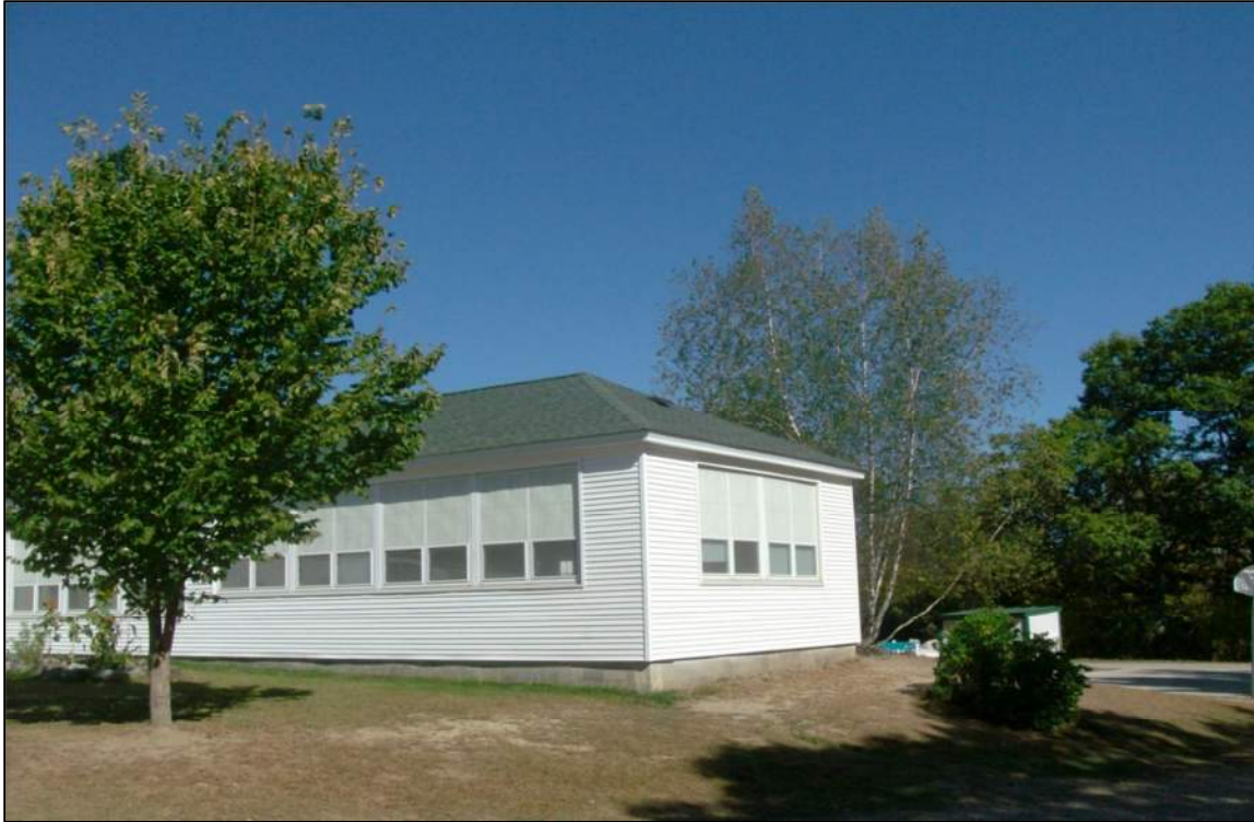
1950 wing on south side with newly shingled roof.